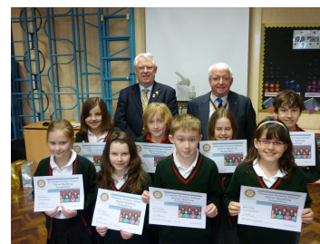
The winning choral speaking team