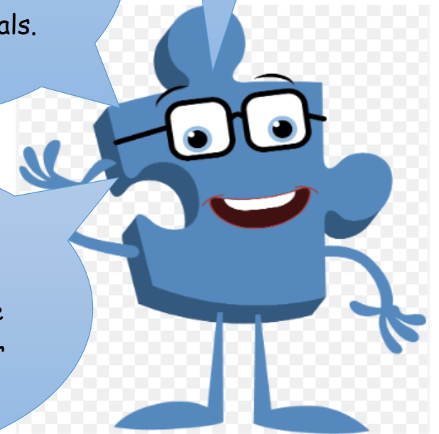
Jigsaw Jaz (Year 4)

I like that everyone can have a go at Jigsaw because there is often not a right or wrong answer.